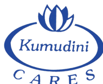
Kumudini Welfare Trust of Bengal (BD) Ltd.