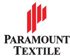
Paramount Textiles Ltd.