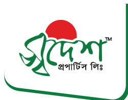
Swadesh Properties Ltd.